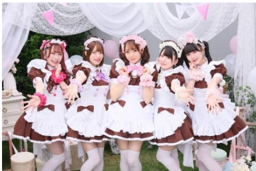
at-home cafe / Akihabara

Akihabara is the sanctuary of Japanese anime and manga culture.